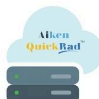
QuickRad PACS Server